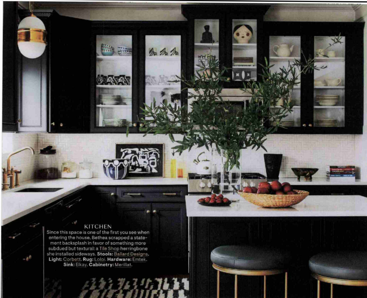
KITCHEN Since this space is one of the first you see when entering the house, Bethea scrapped a statement backsplash in favor of something more subdued but textural: a Tile Shop herringbone she installed sideways. Stools: Ballard Designs. Light: Corbett. Rug: Loloi. Hardware: Emtok. Sink: Elkay. Cabinetry: Merillat.